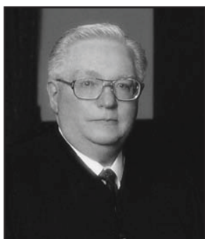
Chief Judge Burrell J. Carter

The Guide to Louisiana Courts features a statewide list of judges, clerks and administrators—complete with contact phone numbers—for Courts of Appeal, District Courts, and City and Parish Courts; and maps of electoral districts for the Supreme Court, the Courts of Appeal, and District Courts.