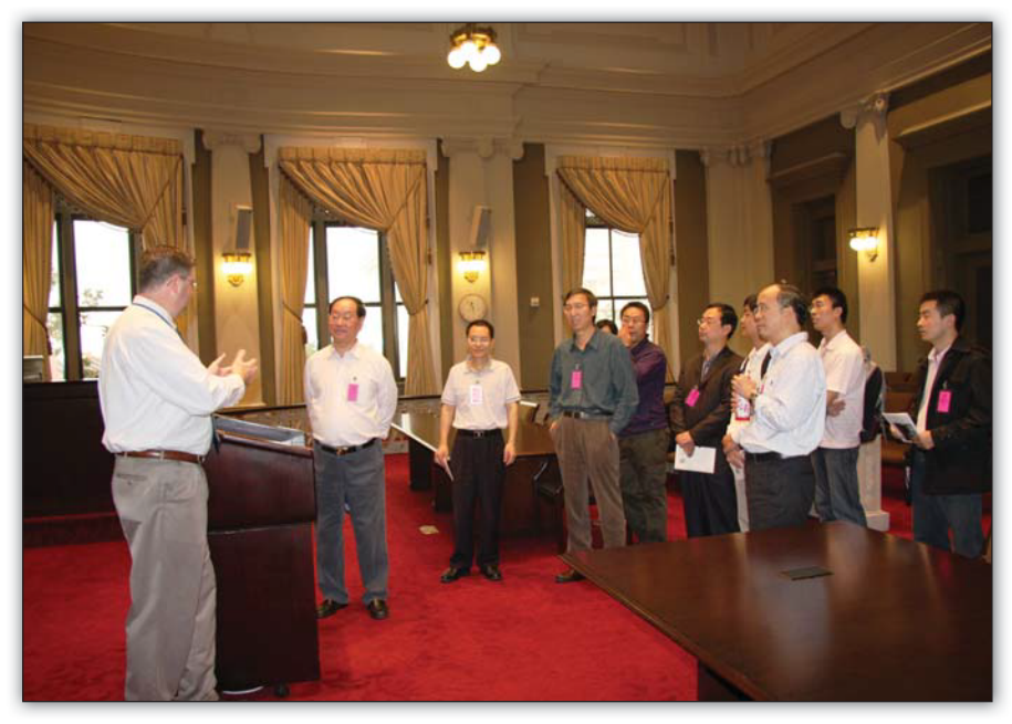
Legal scholars from China toured the Louisiana Supreme Court building during their visit to the New Orleans area, one of several stops across the United States designed to provide insight into judicial and legal practices in the U.S.