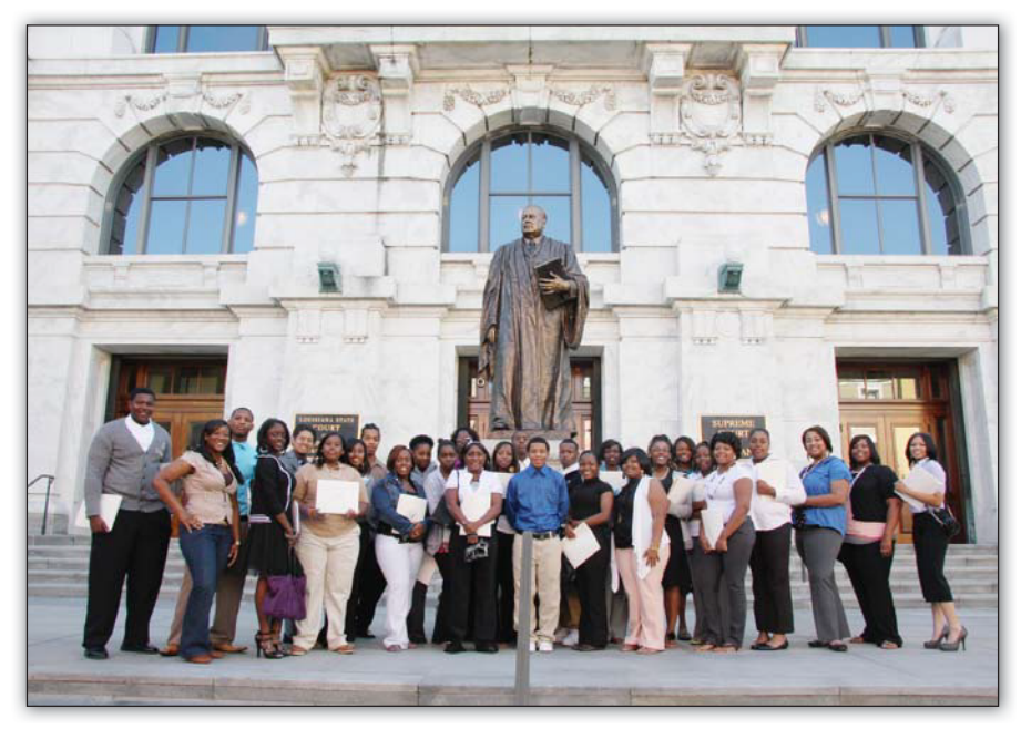
Students from Southern University Law Center's Marshall Brennan Project pose on the front steps of the Supreme Court building following their tour.