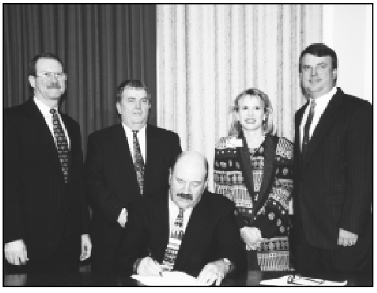
Governor Foster signs Louisiana drug court legislation.

There is a strong national interest in drug courts. Since 1995, the U.S. Department of Justice, through its Drug Courts Program Office, has provided over $60 million in funding for the planning, implementation and enhancement of state drug courts. This strong support, along with the continuing recognition that substance abuse is a major contributor to crime and social problems and that traditional methods of punishing drug offenders have had little impact on the proliferation of substance abuse, suggest that drug courts will play an increasingly visible role in the nation's response to drug-related crime.