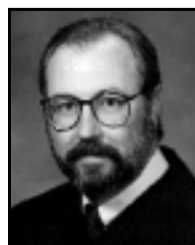
Judge W. Ross Foote 9 th Judicial District Court

"Gideon v. Wainwright. This concept affects every aspect of inherent fairness. It 'leveled the playing field' of criminal law. This case made it clear that the rights guaranteed by the U.S. Constitution would be effective for all citizens, no matter their stature or position in life. In effect, it insured that the Constitution itself would survive."