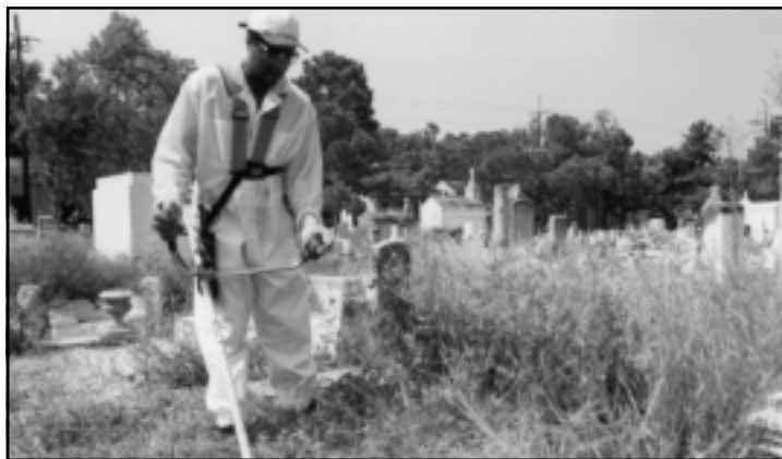
An Orleans Parish traffic offender works off his sentence by cleaning the city's cemeteries of overgrowth and debris.