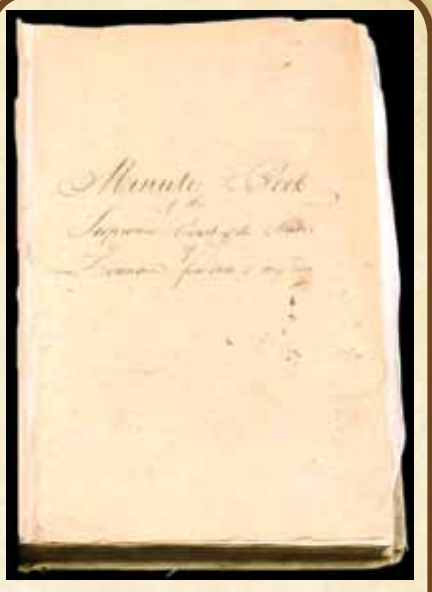
The title page of the original Minute Book of the Louisiana Supreme Court.

2d. That by the 3d sec. of an act of assembly, approved on the 18th of December last, all proceedings in any civil case are suspended.