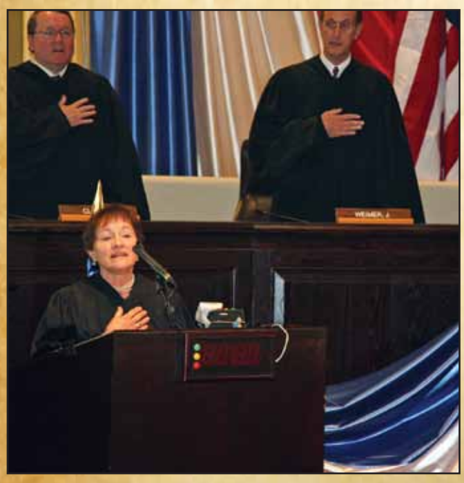
Justice Jeannette Theriot Knoll led the audience in a stately rendition of the National Anthem.