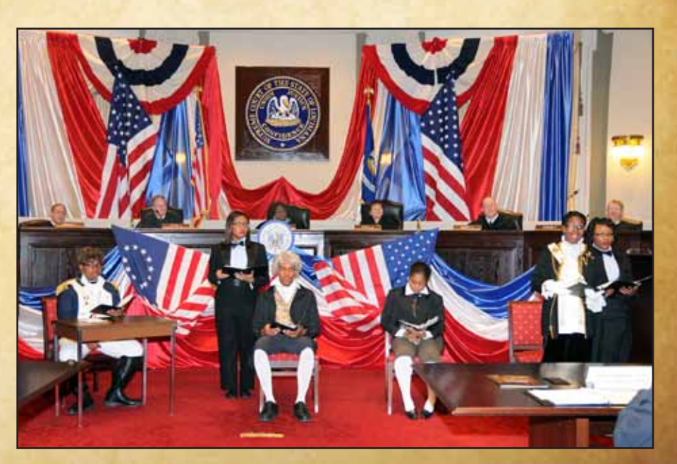
Students from the International High School of New Orleans presented a short, trilingual play titled "An Uncommon Birth: Shaping Louisiana's Legal Tradition for Statehood."