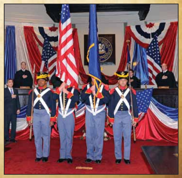
The Washington Artillery presented the colors during the Bicentennial Ceremony.