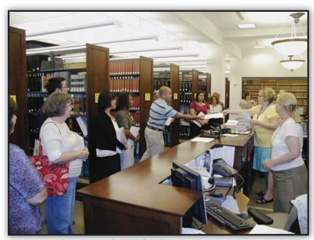
Louisiana Civics and Social Studies teachers, at the court for the Louisiana Center for Law & Civic Education's annual Summer Institute, receive educational information from law librarians.