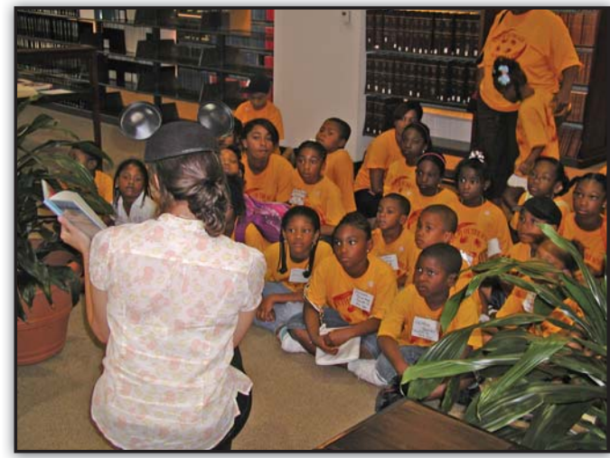
Young visitors from Studio G Summer Enrichment Camp enjoy the telling of "Marshall The Courthouse Mouse."