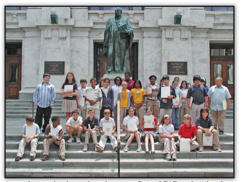
A second group of students, who took part in a Project LEAD mock trial, gather on the front steps of the Royal Street building beside a statue of Justice E.D. White.