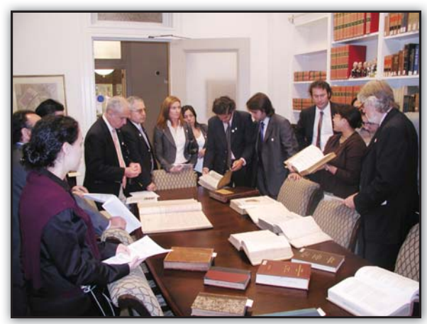
Lawyers, all of whom are graduates of Austral University in Buenos Aires, Argentina, examine the Rare Books collection during a visit to the Law Library of Louisiana.