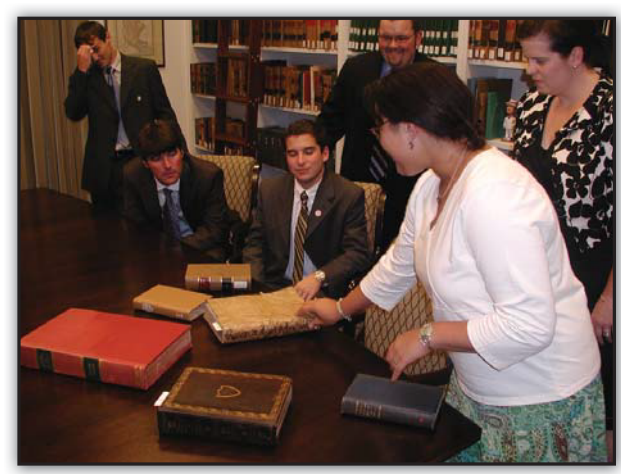
Summer law clerks from the Phelps Dunbar firm learn about the rare books collection in the Law Library of Louisiana.