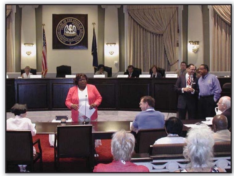
Prior to the National Conference of State Legislatures holding a mock legislative session at the Supreme Court, Justice Bernette J. Johnson (center at microphone) and 4th Circuit Court of Appeal Judge Edwin Lombard (standing far right) addressed the international delegations.