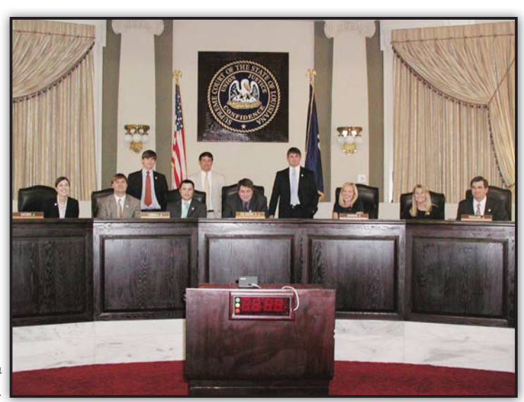
Kean Miller law clerks gather together in the courtroom following a tour of the building.

Visitors from the Awesome Girls Mentoring Program view a model of the French Quarter, circa 1915, on display in the Louisiana Law Museum.