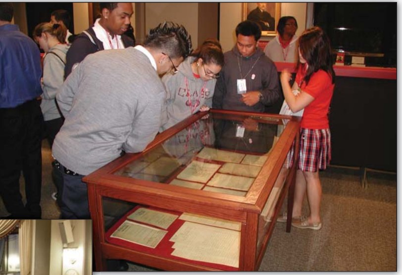
During their tour of the Louisiana Supreme Court, students from Riverdale High School view documents from the case Plessy v. Ferguson, on display in the Louisiana Law Museum, located on the 1st floor of the Court's 400 Royal Street home.