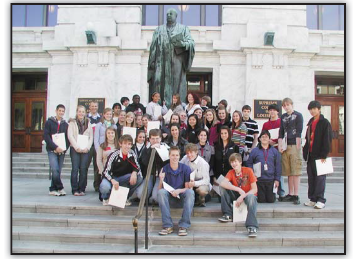
Students from Fontainebleau High School pose in front of the 400 Royal Street building following their tour in November.