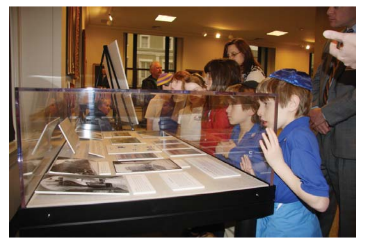
New Orleans Jewish Day School students, shown here in the Louisiana Law Museum, met Supreme Court Justice Greg Guidry after touring the building.