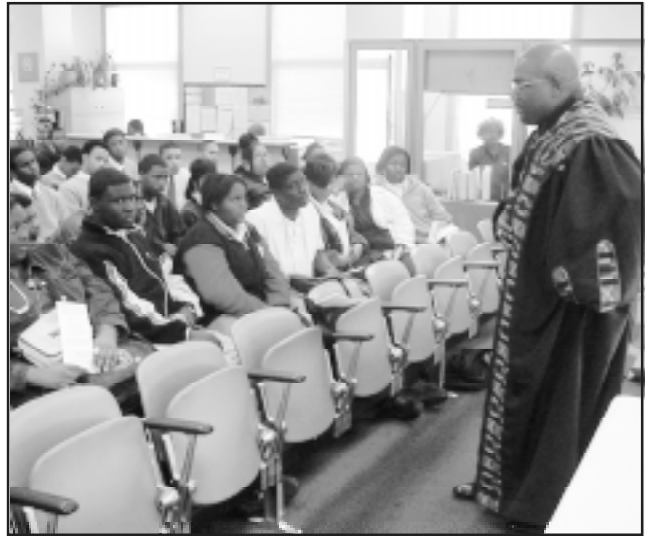
Judge King speaks to students from Lawless and St. Augustine High Schools as part of a special Community Court Day Program. The students also sat in on a case in Judge King's court.

of domestic court and were able to sit in on a case over which Judge King presided, giving them background information they might not have otherwise had on the court system and a first-hand look at an actual court proceeding.