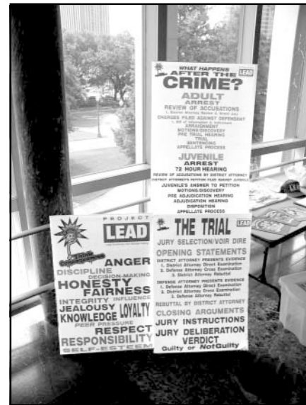
Project L.E.A.D. signboards provides students with additional direction for their mock trial.