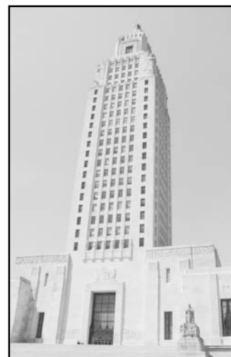
The Louisiana State Capitol Building in Baton Rouge

In conclusion, let me again say what an honor and privilege it is to be before you today. I would be remiss if I did not mention the employees of all of our state courts, their relatives, and the employees, relatives and friends of you, the members of the Legislature, who are at this moment fighting in a distant land to promote, protect and preserve the freedoms and democracy that we enjoy, and which give us the opportunity to be here today, participating so actively in our state government. On behalf of the state judiciary, thank you to our soldiers, especially our Louisiana sons and daughters. May all of you return safely home soon. And thank you, the dedicated members of our state Legislature, for opening your chamber to us today, for your attention to my remarks, and for your unfailing devotion to the people of Louisiana.