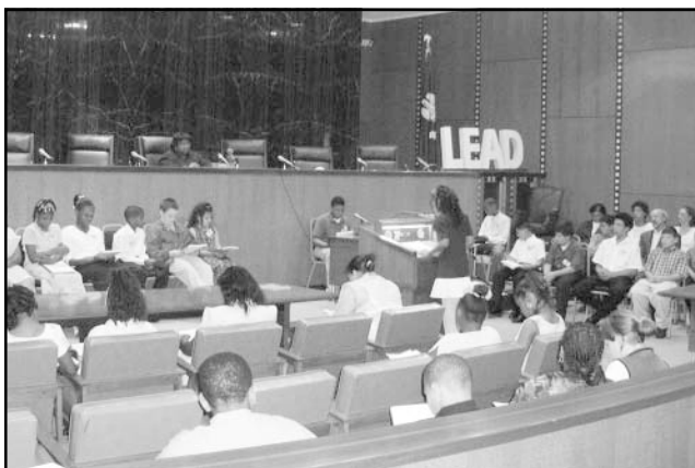
The Project L.E.A.D. mock trial at the Louisiana Supreme Court.

In addition to hosting the mock trial, the Louisiana Supreme Court also sponsored a "What Law Day Means to Me" Poster Contest for Louisiana middle and high school students participating in the Celebrate Your Freedom Youth Summit conducted by the Louisiana Center for Law Related Education.